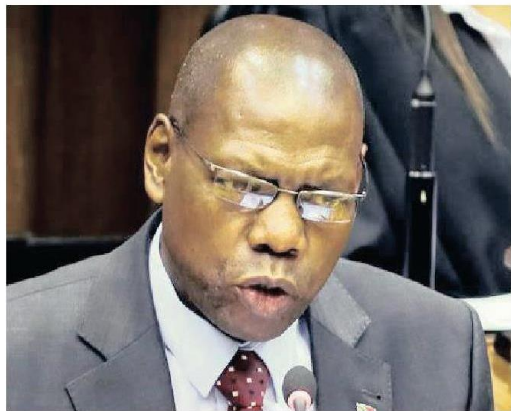
Dr Zweli Mkhize